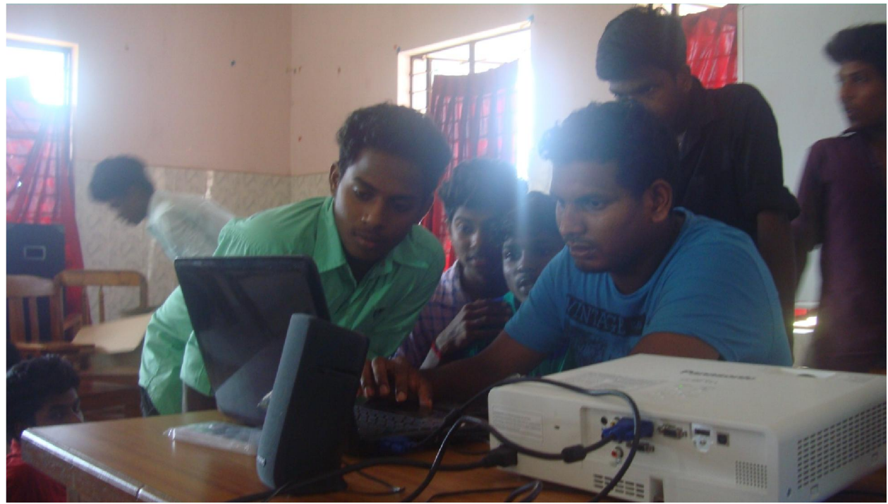
Most MRS students hail from hugely disadvantaged households often poorer than the households of their counterparts studying in other government or aided schools. Majority of the parents are first generation literates, who cannot provide effective mentoring for their children in terms of their education. The performance level of students in MRS is not at a desired level; with only a small segment obtaining good results that are comparable with their counterparts studying in other Government or Aided schools . Though Model Residential Schools offer a framework to provide best possible school education for children from disadvantaged backgrounds, 'underachievement' is a serious issue and it is in this backdrop the Government assigned to CREST a three year pilot project to improve the overall educational outcomes of the students. The project is fully funded by Scheduled Castes Development Department of Kerala.

admission is given from 5th standard, based on the marks they obtain in the state level entrance examinations. In order to provide best learning experience, low teacher-student ratio is retained with only 35 students in a class room so that individual attention is given , extra class room tuition facilities are provided and students are given inputs in computer skills and general subjects through a programme called 'chuvaduveppu' (footsteps). Students are expected to acquire better schooling in comparison with other Government/Aided schools where in fact the vast majority of SC/ST students are enrolled. Schools follow the syllabus of the Kerala State Boards of Examinations. Teachers are appointed by Education Department of Kerala. Schools are under the supervision of Scheduled Castes Development Department and personnel from the Department function as the superintendents of schools to provide students with adequate support in terms of their overall welfare. Of the nine schools, four schools have Plus Two level education where students have facility to undergo science education with Physics, Chemistry, Biology and Mathematics as subjects.