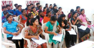
Students at the workshop conducted at DIET.

Centre for Research and Education for Social Transformation (CREST), the prominent city-based training organisation, has launched a workshop for the Plus-2 students from the Model Residential Schools, under the department of scheduled castes in the state, to empower them for entrance examinations to national-level universities and other prominent institutions. The workshop started on March 30 caters to a total of 80 students including 60 girls. It will conclude on April 20 at the District Institute of Education and Training at Sulthan Bathy Wayanad. CREST is an autonomous body engaged