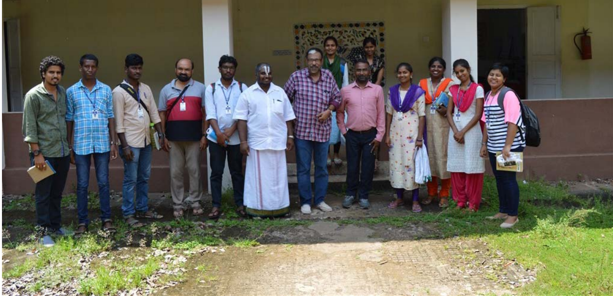
November 2019, students doing the MSW program of Calicut University at WMO College, Muttil , Wayanad also visited CREST and interacted with the students and the faculty. A special lecture on Social Exclusion was held for the students at CREST.