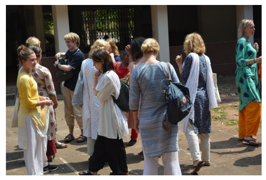
in Kerala, social security etc.

for Professional Development (PGCCPD) on 3 Feb 2020 . A special lecture was organized for the students of Globala gymnasiet on social exclusion. Globala gymnasiet is an upper secondary school that is located in Stockholm, the capital of Sweden. They visited Centre as a part of their academic program understand India. The students from the college were involved group discussions with students of CREST in different groups, covering various themes like gender, agriculture