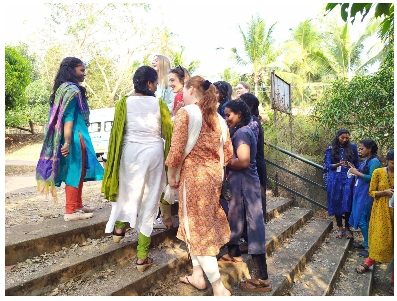
Metropolitan University (formerly Oslo and Akershus University College (HiOA)) and CREST,

Following the MoU signed between Faculty of Education and International Studies , Oslo