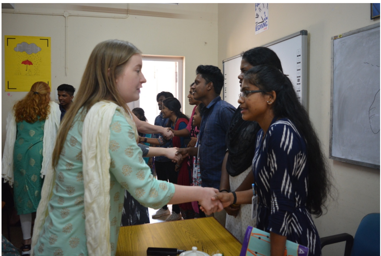
students undergoing the Post Graduate Certificate Course for Professional Development ( PGCCPD) at CREST .

fourteen students from the University visited CREST as a part of academic collaboration between the two institutions. On 25^{th} of February 2020, students from both institutions jointly organized thematic workshops on a broad range of issues concerning India and Norway . They will be attached to CREST for 45 days and as interns the students will be exposed to themes of gender, health, livelihood and return migration from the Gulf countries, under the supervision of the faculty of CREST. They will also undertake field interactions facilitated by CREST in Wayanad Kozhikode and Kollam. CREST will also be facilitating peer level interaction of these students with the